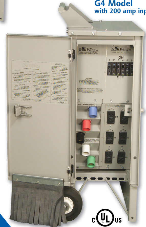
G4 Model with 200 amp input